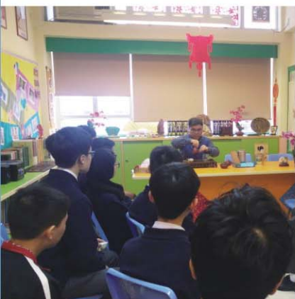
Chinese Corner 中文閣