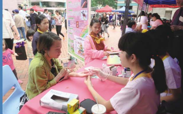
Community Service Day 社區服務日

CYC Member Merit Award Scheme: Outstanding student volunteers are awarded the Purple Badge (Secondary School Level 3) 公益少年團團員獎勵計劃：優秀學生義工獲頒授中學高級紫色徽章