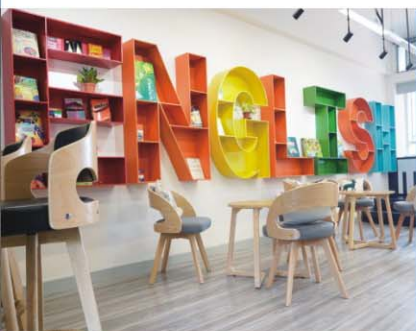
English Corner 英語角