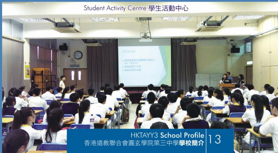
Student Activity Centre 學生活動中心