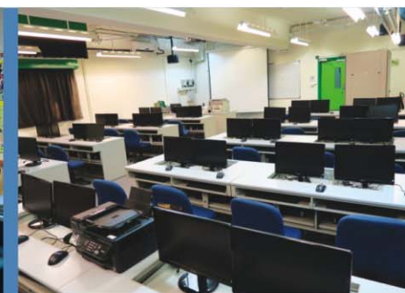
Multi-Media Learning Centre 多媒體學習中心