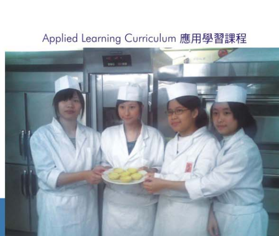
Applied Learning Curriculum 應用學習課程