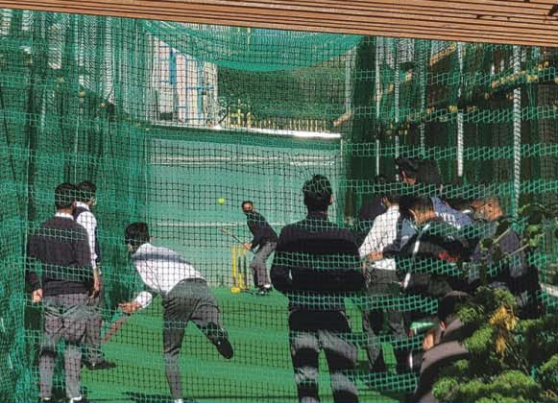
"The Shot" Practice Net 善擊場