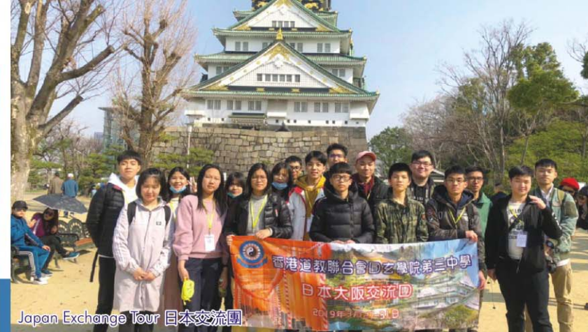
Japan Exchange Tour 日本交流團