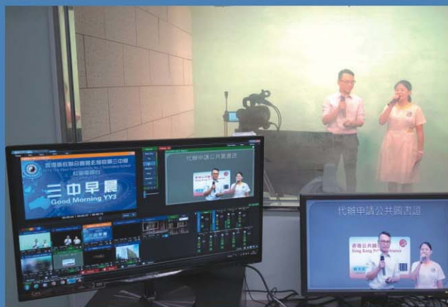
Campus TV 校園電視台