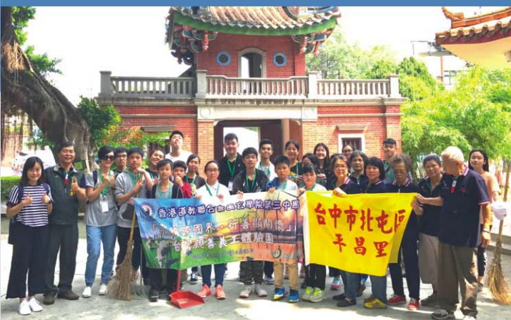
Voluntary Service Experiential Tour of Taiwan 台灣親善義工體驗之旅