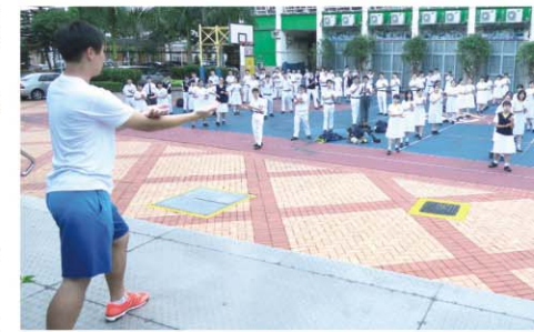
Tai Chi Practice 強身健體太極操