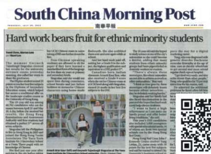
South China Morning Post 南華早報