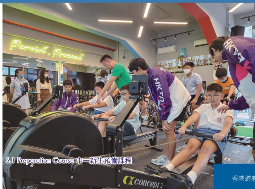
S.1 Preparation Course 中一新生預備課程

每年舉辦多個不同的國內及國外遊學團，如「悉尼之旅」、「英國之旅」、「南韓之旅」、「馬來西亞之旅」、「新加坡之旅」、「北京之旅」、「海南之旅」等，擴闊學生視野。