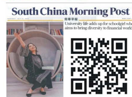
South China Morning Post 南華早報