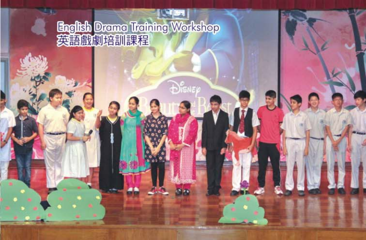
English Drama Training Workshop 英語戲劇培訓課程