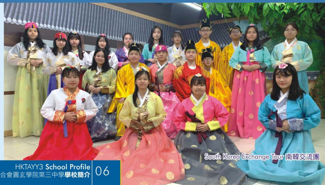
South Korea Exchange Tour 南韓交流團