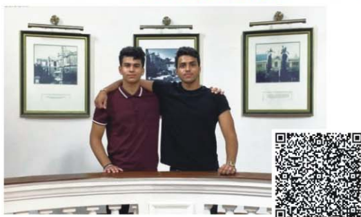
Hong Kong Economic Times 經濟日報