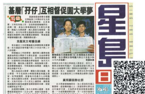
Sing Tao Daily 星島日報