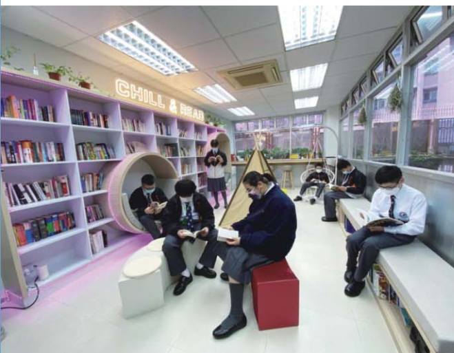
Wisdom Reading Room 明道書室