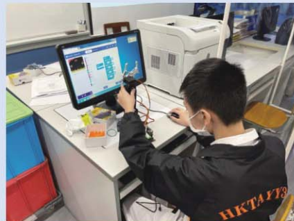
AI Robotic arm 人工智能機械臂