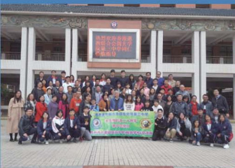
Greeting our Sister School——Guangzhou Huadu YuenYuenSecondary School 接待姐妹學校——廣州花都圓玄中學