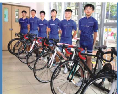
Cycling Training Centre 單車訓練中心