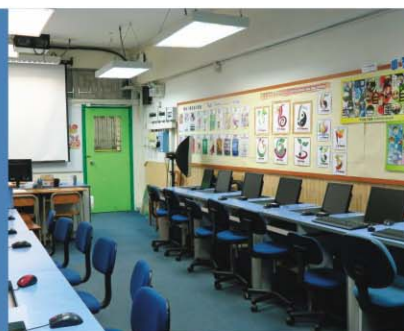
Computerized Art Room 電腦美術創作室