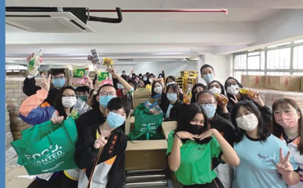
Volunteer service in Feeding Hong Kong 樂餉社義工服務