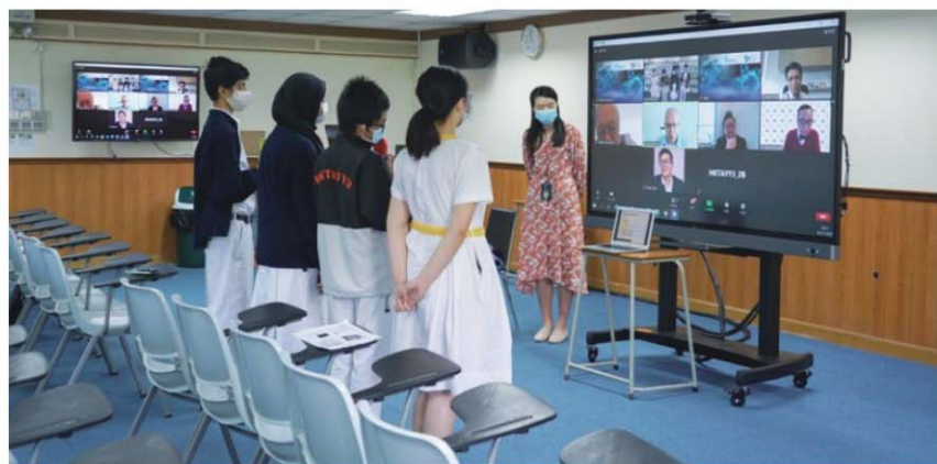
Distance Learning Classroom 遙距教室