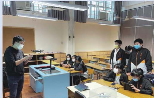
Drone Programming 無人機編程

自訂與STEAM相關的課程及編寫教材，透過不同有趣的活動，有系統地提升中一及中二級學生協作、解難、傳意、分析及自學等能力。