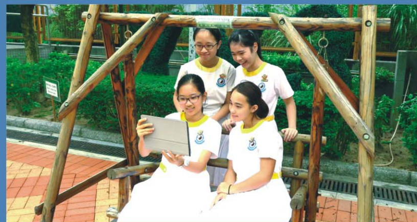
Wireless Network Wi-Fi and Tablet Computers Wi-Fi無線網絡及平板電腦