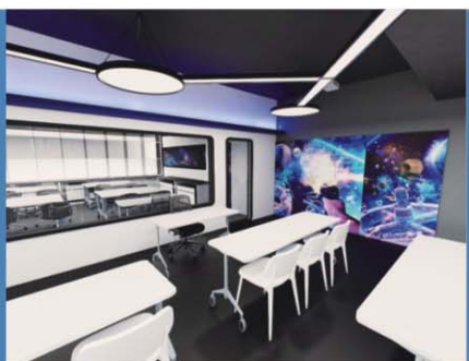
i-Maker Studio 玄創坊