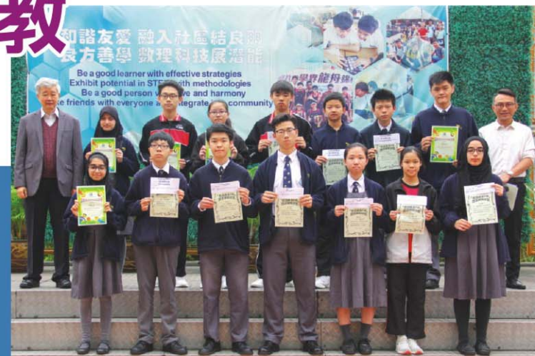
Reading with Fun Programme 悅讀越多FUN計劃