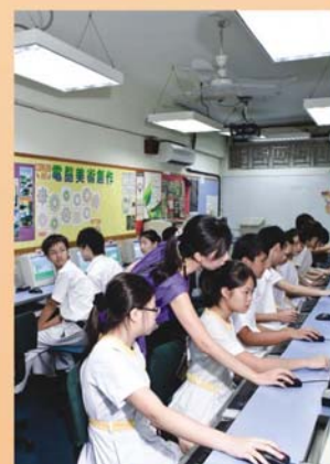
Computerized Art Room 電腦美術創作室