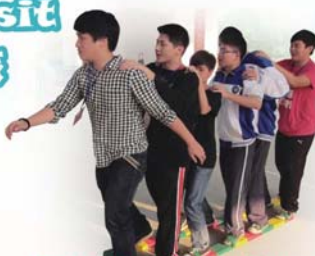
When having exchange in the village, students from both Guangxi and Hong Kong had so much fun together! 到農村進行交流時，兩地同學打成一片！

另外，此團最富意義的是一眾同學到南寧社會安老院進行親善探訪，並到達貧窮落後的農村進行交流，同學深深體會「施比受，更有福」的道理。