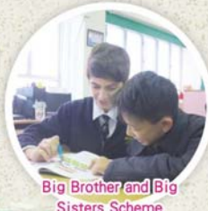
Big Brother and Big Sisters Scheme 大哥哥大姐姐伴讀計劃