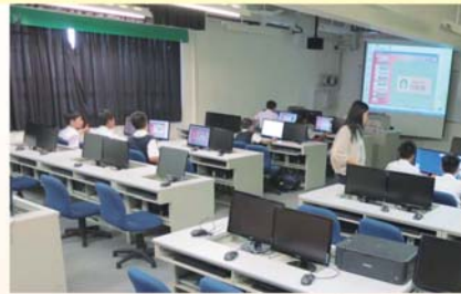
Multi-Media Learning Centre 多媒體學習中心