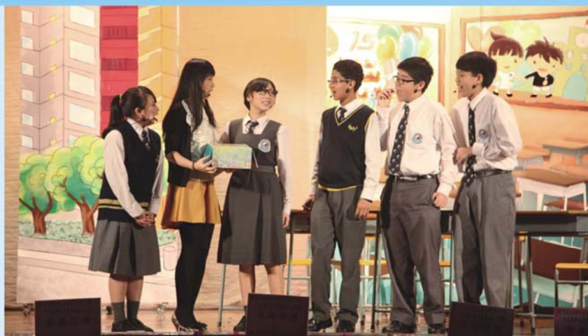
Drama and Musical Club 戲劇及音樂劇團