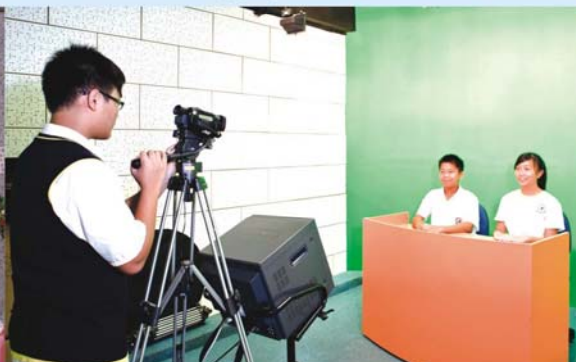
Campus TV 校園電視台