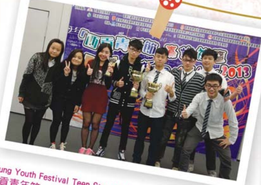
Sai Kung Youth Festival Teen Star Art Competition 2013, Various Prize 「西貢青年節」Teen藝新星大比拼2013 囊括多個項目的獎項