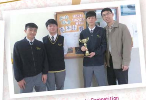
Inter-school Table-tennis Competition Boy's B Grade, The Fourth 學界乒乓球比賽男子乙組殿軍