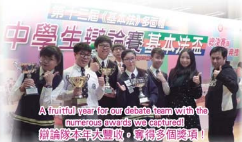
A fruitful year for our debate team with the numerous awards we captured! 辯論隊本年大豐收，奪得多個獎項！