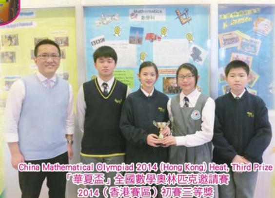
China Mathematical Olympiad 2014 (Hong Kong) Heat, Third Prize 「華夏盃」全國數學奧林匹克邀請賽 2014 (香港賽區) 初賽三等獎