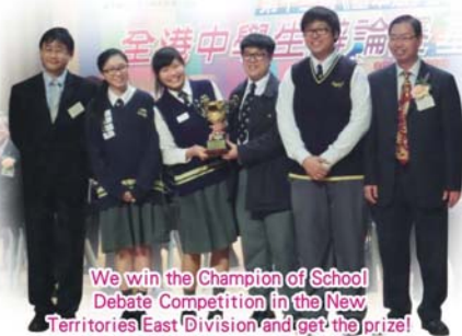
We win the Champion of School Debate Competition in the New Territories East Division and get the prize! 同學勇奪新界東冠軍，到台上領獎！

Our debate team had achieved outstanding results in a lot of inter-school competitions this year, and among all, they captured the Champion for the Hong Kong Secondary School Debate Competition (Basic Law Championship) in the New Territories East Division! The competition was very exciting as we beat lots of secondary schools on our way. In all competitions, our debaters had managed to also capture the Best Debater Awards! Congratulations!