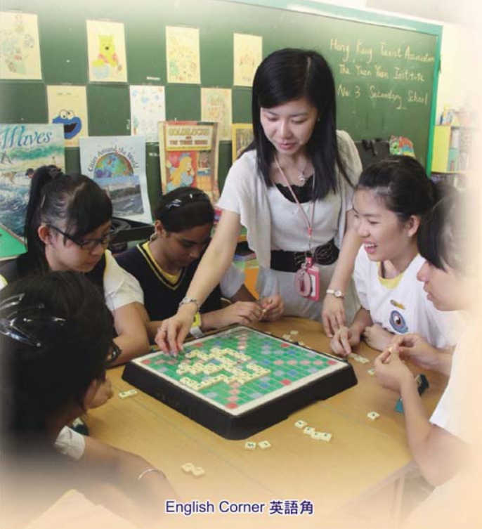
English Corner 英語角