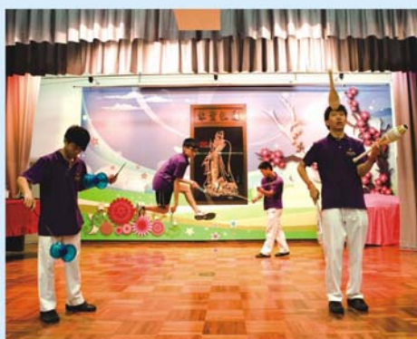
Juggling Club 雜耍班