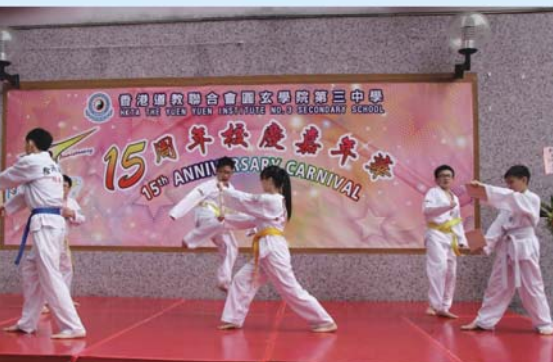
Taekwondo Club 跆拳道