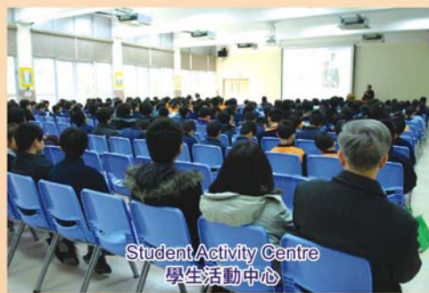
Student Activity Centre 學生活動中心