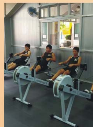
East Kowloon Indoor Rowing Training Centre 九龍東室內賽艇訓練中心