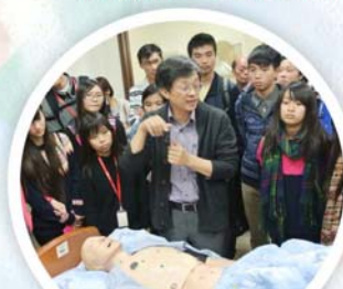
The Faculty of Medicine in I-Shou University is very well-equipped! It must be the place for nurturing excellent medical professionals! 義守大學的醫學院設備齊全，是訓練優秀醫療人員的地方！

Apart from visiting universities, they had also visited different famous tourist spots in Taiwan, which included the Feng Chia Night Market, Salt Mountain in Cigu, Qijin Old Street, Kaisyuan Night Market, An Ping Old Street, Old Castles, etc. These are all eye-opening experiences!