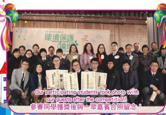
Our participating students took photo with our guests after the competition! 參賽同學獲獎後與一眾嘉賓合照留念！

本校於香港電台聯校通識學生論壇再度奪冠而回，比賽主要辯論不同環保議題，共有九所中學參賽，包括鄧鏡波學校、香港管理專業協會李國寶中學及保良局胡忠中學等。本校於初賽中脫穎而出，並於決賽獲勝，奪得冠軍、團體精神獎等多個獎項！