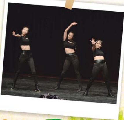
Hong Kong Schools Dance Festival (Jazz solo/duet/trio dance), Honours Award 學校舞蹈節(爵士單/雙/三人舞組)甲等獎