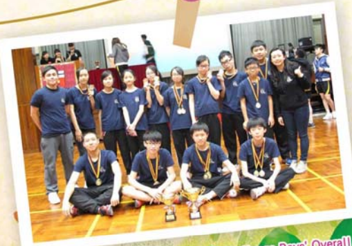
K S Lo Inter-school Rope Skipping Challenge Boys' Overall 1st runner-up, Girls' Overall 2nd runner-up 羅桂祥盃速度跳繩錦標賽2014 男子組全場總亞軍, 女子組全場總季軍