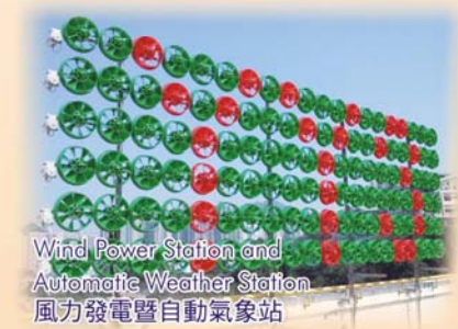
Wind Power Station and Automatic Weather Station 風力發電暨自動氣象站