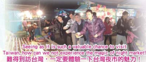
Seeing as it is such a valuable chance to visit Taiwan, how can we not experience the magic of night market! 難得到訪台灣，一定要體驗一下台灣夜市的魅力！

除參訪大學外，亦遊覽了不少台灣著名景點包括：逢甲夜市、七股鹽山、旗津老街、凱旋夜市、安平老街、古堡等，大大擴闊同學的眼界！