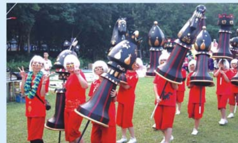
Visual Arts Club 視覺藝術學會