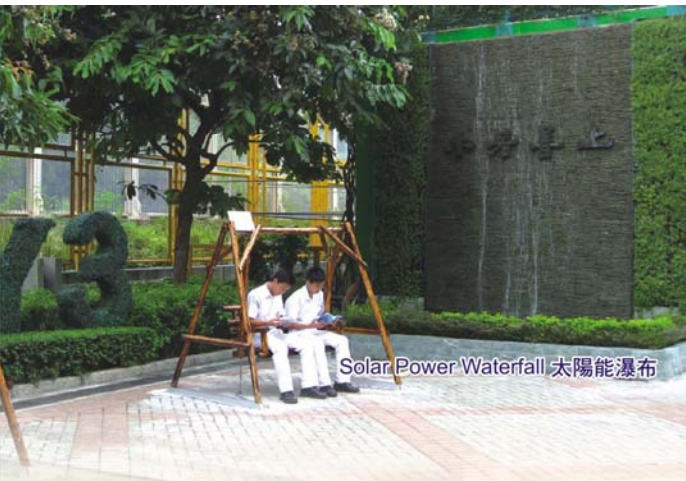
Solar Power Waterfall 太陽能瀑布