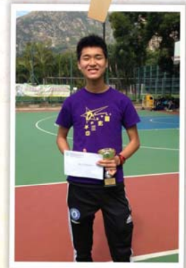
Tuen Mun New Year Long-distance Run Men's Youth, 2nd Runner-up 屯門區新春長跑比賽男子青少年組季軍