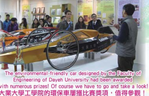
The environmental-friendly car designed by the Faculty of Engineering of Dayeh University had been awarded with numerous prizes! Of course we have to go and take a look! 大葉大學工學院的環保車屢獲比賽獎項，值得參觀！