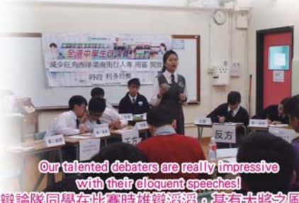
Our talented debaters are really impressive with their eloquent speeches! 辯論隊同學在比賽時雄辯滔滔，甚有大將之風！

本校辯論隊本年於多個校際比賽獲得理想成績，尤其於全港中學生辯論賽(基本法盃)勇奪新界東冠軍，比賽過程非常激烈，本校成功擊敗多間中學(見附表)，而當中本校同學包辦全部場次的最佳辯論員獎，可喜可賀！