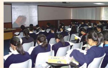
Lecture Theatre 大型演講室