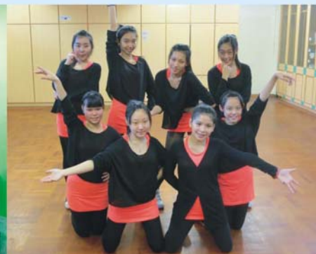
Dancing Club 舞蹈學會