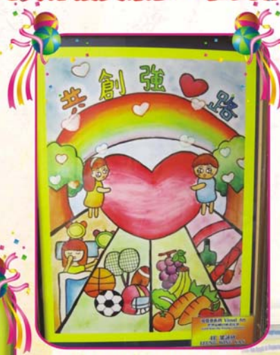
World Heart Day 2013 Drawing Competition, Elite Prize and Silver Prize (Group) 「世界心臟日」香港心臟基金會繪畫比賽 精英獎及團體銀獎