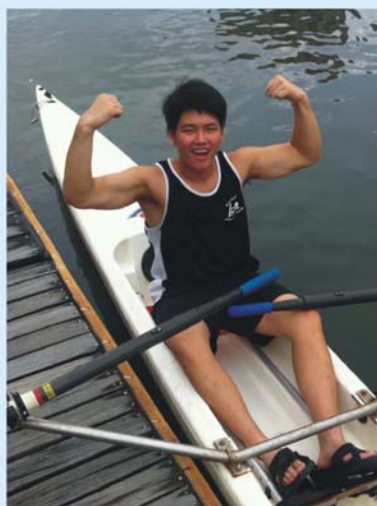
Rowing Club 划艇學會