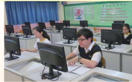
Computer Room 電腦室