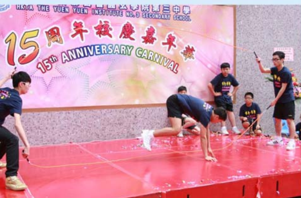
Rope Skipping Team 花式跳繩隊