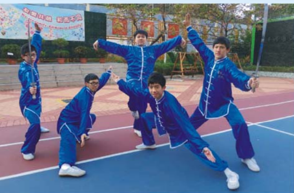
Wushu Team 武術隊