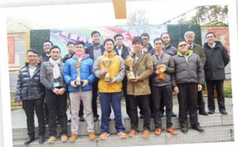
The New Territories Teachers (Men) Basketball Competition 2013, Champion for Three Years 新界校長會——教師(男子)2013籃球比賽三連冠