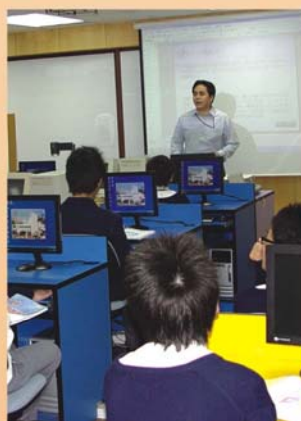
Graphic Design and Technology Room 圖像設計科技創作室