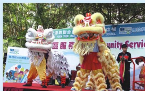
Lion Dance Team 獅藝隊