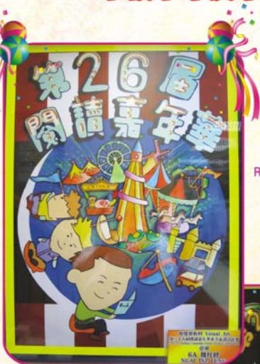
Reading Carnival Poster Design Competition, 1st Runner-up and 2nd Runner-up 閱讀嘉年華永亨盃海報設計比賽奪得 ◀亞軍及季軍▶