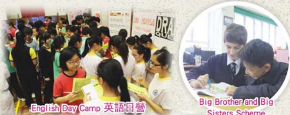
English Day Camp 英語日營