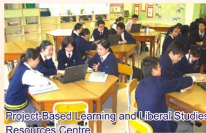
Project-Based Learning and Liberal Studies Resources Centre 專題研習暨通識教育資源中心