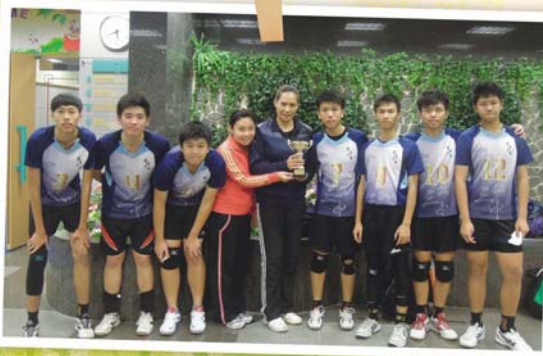
Inter-school Volleyball Competition Boys A Grade, 2nd Runner-up 男子學界甲組排球比賽季軍