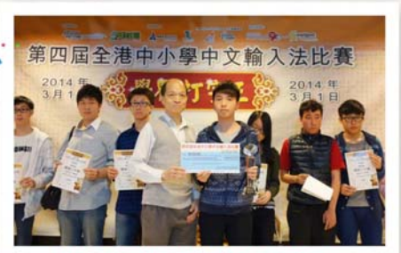
Hong Kong Inter-School Chinese Typing Competition, Typing Champion 全港中小學中文輸入法比賽打字王冠軍