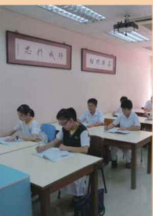
Student Study Room 學生溫習室