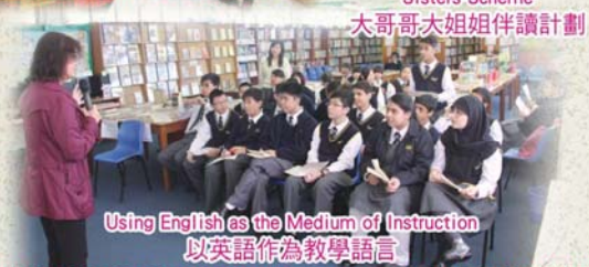
Using English as the Medium of Instruction 以英語作為教學語言