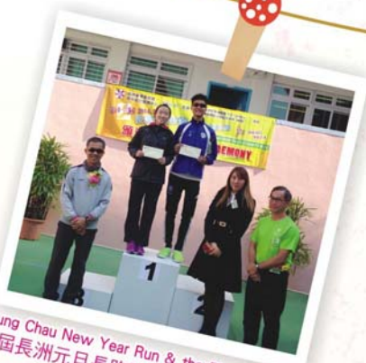
The 13th Cheung Chau New Year Run & the 5km Charity Run, Champion 第十三屆長洲元旦長跑暨五公里慈善賽全場總冠軍