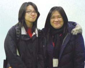
YY3 has graduates studying in Feng Chia University now! Let's take a photo of this warm moment! 逢甲大學正有畢業於我校學生就讀，份外親切，一定要合照留念！

Our School and The Yuen Yuen Institute No. 2 Secondary School co-organized an overseas trip to visit Taiwan's universities from 23-26 December, 2013. There were 54 teachers and 12 students visiting 4 universities in Taiwan, which included Feng Chia University, Dayeh University, National Chi Nan University, and I-Shou University. During the visit, the teachers and the students got to know more about different universities in greater depths, including their special courses and departments, their admission criteria, facilities, tuition, accommodation fees and scholarships, etc. They had also attended sharing sessions from Hong Kong students who pursued further studies in Taiwan, so as to know more about the preparation in studying Taiwan Universities.