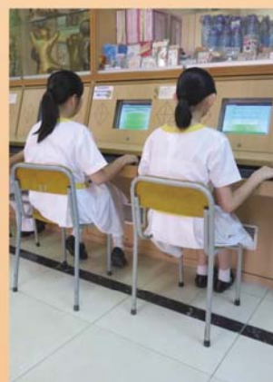
Computer Station 電腦資訊站