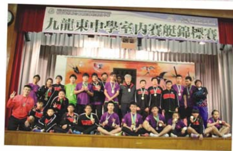
Kowloon East Inter-school Indoor Rowing Competition, Captured Many Champions 九龍東中學室內賽艇邀請賽多項冠軍