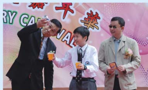
Magic Club 魔術學會